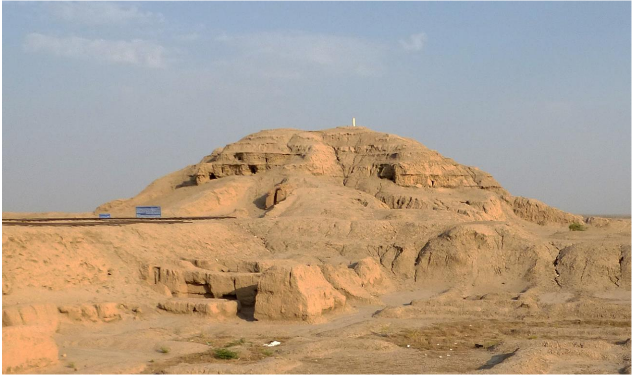
White Temple ziggurat in Uruk